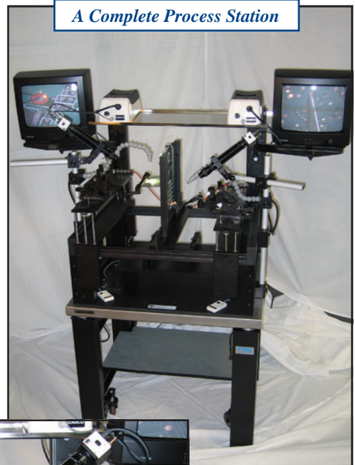
A Complete Process Station